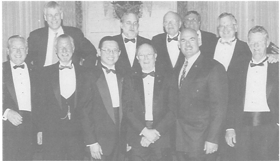
25 Year Pin Recipients at Dinner Dance