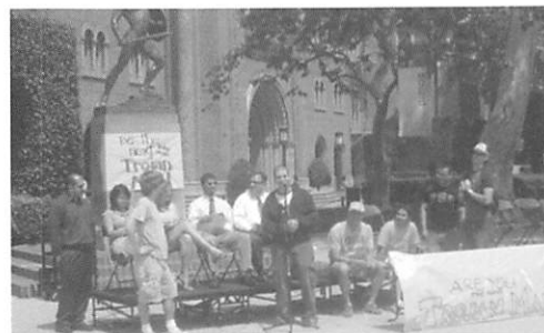
The Trojan Man Contest in front of Tommy Trojan