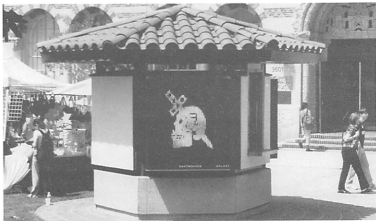
Skull and Dagger on Message Board