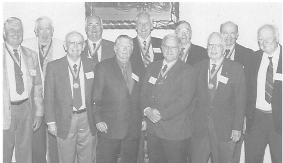
Morley Medallion recipients at Breakfast